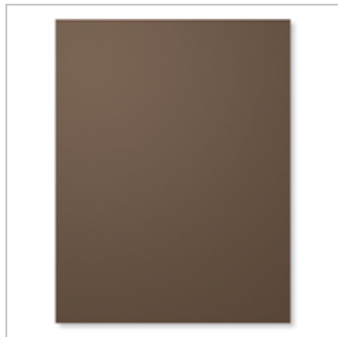
Early Espresso 8-1/2" X 11" Cardstock