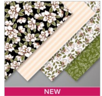
Magnolia Lane Bulk Designer Series Paper