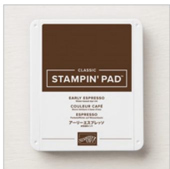
Early Espresso Classic Stampin' Pad