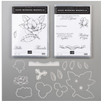
Good Morning Magnolia Bundle