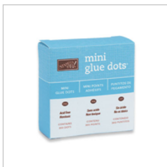
Mini Glue Dots