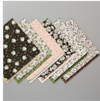
Magnolia Lane Designer Series Paper