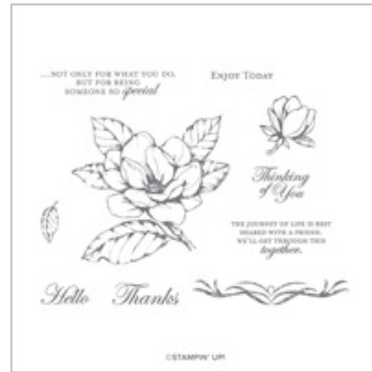
Good Morning Magnolia Cling Stamp Set