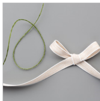
Magnolia Lane Ribbon Combo Pack