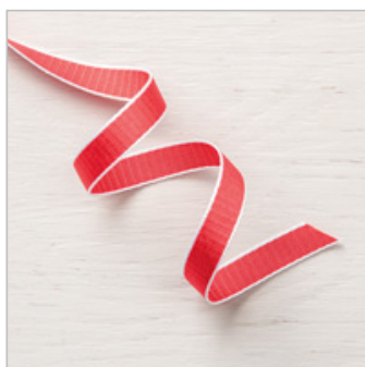
Poppy Parade 1/2" (1.3 Cm) Textured Weave Ribbon