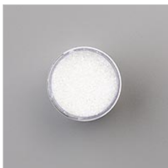
Ice Stampin' Glitter