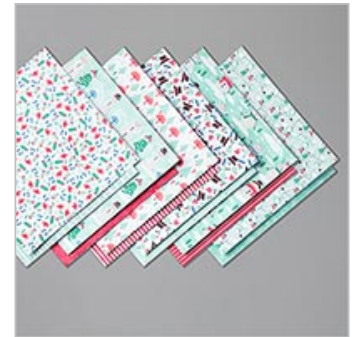
Let It Snow Specialty Designer Series Paper