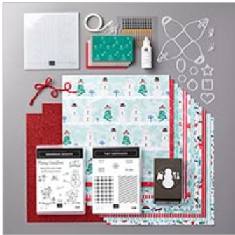
Let It Snow Suite Bundle (En)