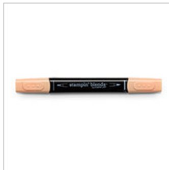
Pumpkin Pie Light Stampin' Blends