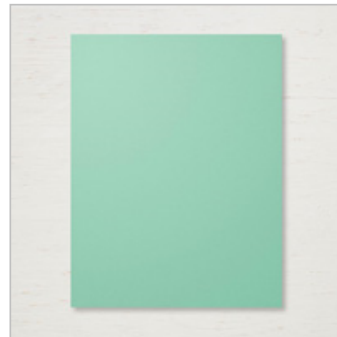
Coastal Cabana 8-1/2" X 11" Cardstock