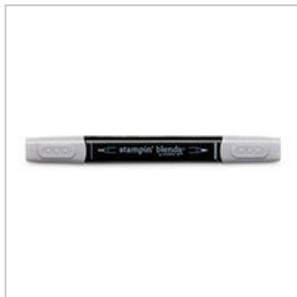
Smoky Slate Light Stampin' Blends