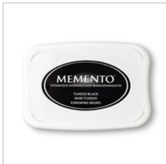
Tuxedo Black Memento Ink Pad