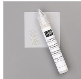
Shimmery Crystal Effects