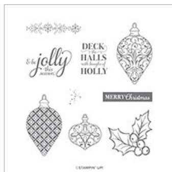
Christmas Gleaming Cling Stamp Set (En)