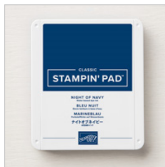
Night Of Navy Classic Stampin' Pad