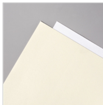
Very Vanilla 8-1/2" X 11" Thick Cardstock