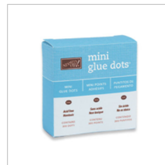
Mini Glue Dots