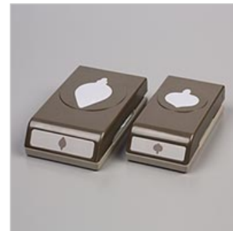
Gleaming Ornaments Punch Pack