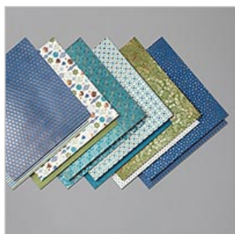
Brightly Gleaming Specialty Designer Series Paper