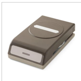
Classic Label Punch