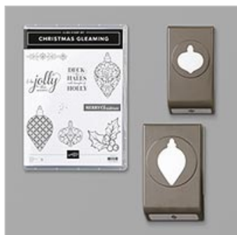
Christmas Gleaming Bundle (En)