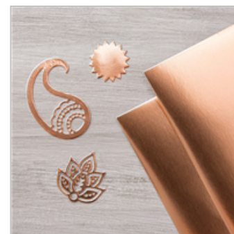
Copper Foil Sheets