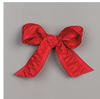
Real Red 1" (2.5 Cm) Ruched Ribbon