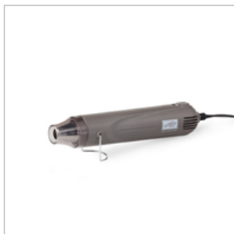
Heat Tool (Us And Canada)