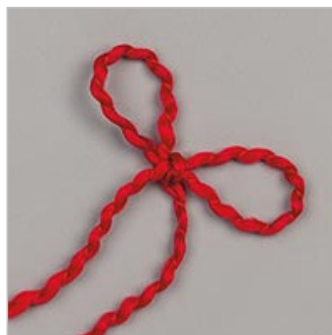
Real Red 1/8" (3.2 Mm) Curly Ribbon