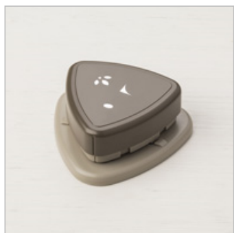
Detailed Trio Punch