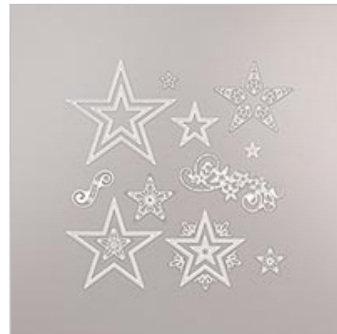
Stitched Stars Dies