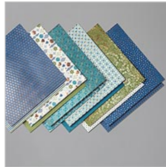
Brightly Gleaming Specialty Designer Series Paper