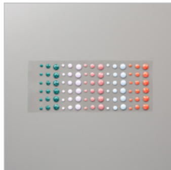
2019-2021 In Color