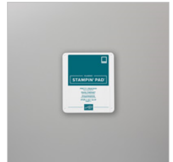
Pretty Peacock Classic Stampin' Pad