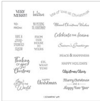
Itty Bitty Christmas Cling Stamp Set (En)