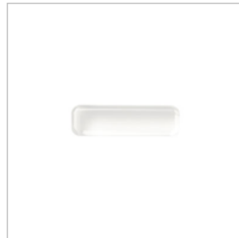
Clear Block G