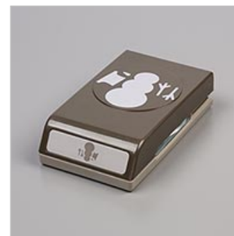
Snowman Builder Punch