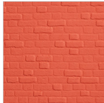
Brick & Mortar 3D Embossing Folder