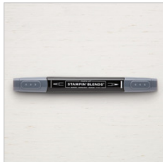
Basic Black Dark Stampin' Blends