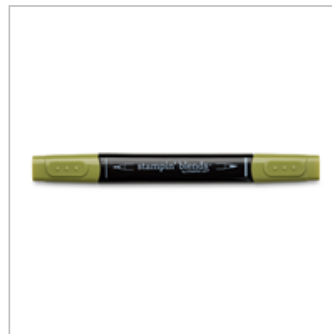
Old Olive Dark Stampin' Blends