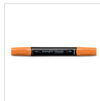
Pumpkin Pie Dark Stampin' Blends Marker