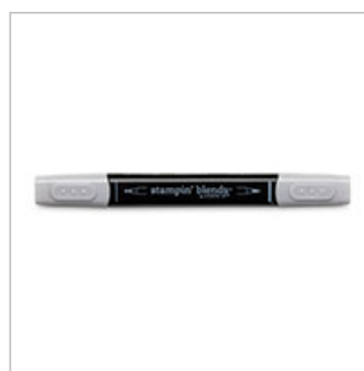
Smoky Slate Light Stampin' Blends Marker