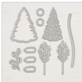
In The Woods Dies