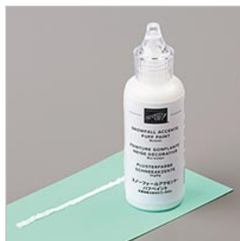
Snowfall Accents Puff Paint