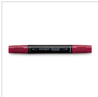
Cherry Cobbler Dark Stampin' Blends