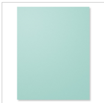
Pool Party 8-1/2" X 11" Cardstock