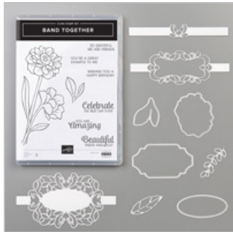
Band Together Bundle