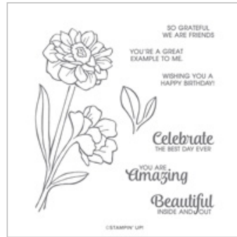
Band Together Cling Stamp Set