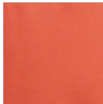
Subtle 3D Embossing Folder