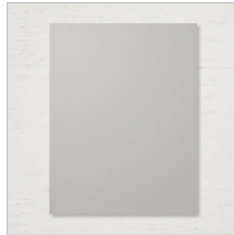
Gray Granite 8-1/2" X 11" Cardstock