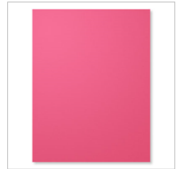
Melon Mambo 8-1/2" X 11" Cardstock