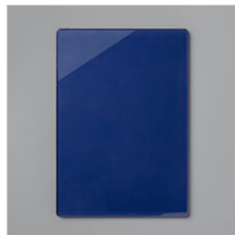
3D Embossing Folder Plate