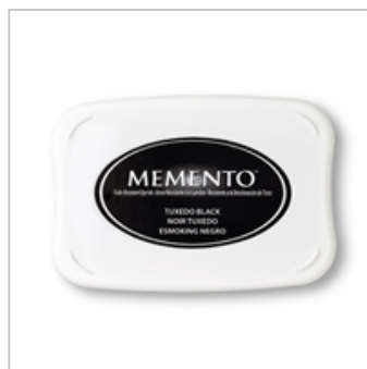
Tuxedo Black Memento Ink Pad