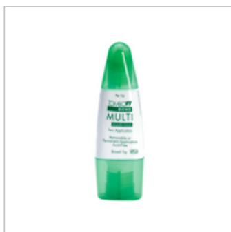
Multipurpose Liquid Glue