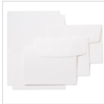
Whisper White Note Cards & Envelopes