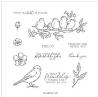
Free As A Bird Cling Stamp Set