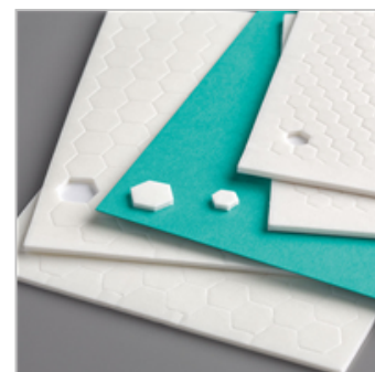
Mini Stampin' Dimensionals