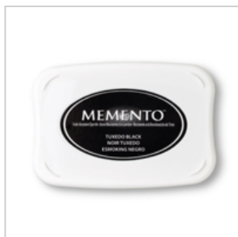
Tuxedo Black Memento Ink Pad