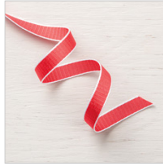
Poppy Parade 1/2\"/>