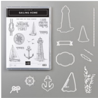
Sailing Home Bundle