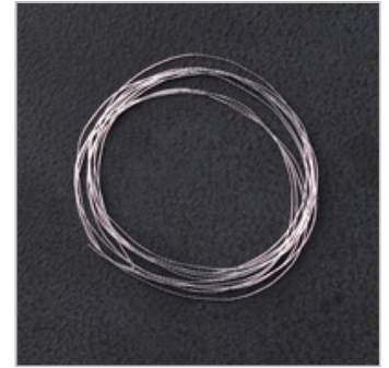
Silver Metallic Thread