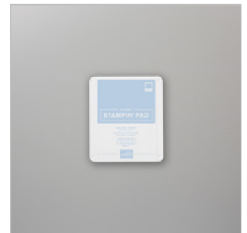
Seaside Spray Classic Stampin' Pad