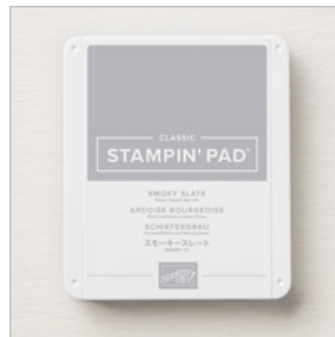
Smoky Slate Classic Stampin' Pad