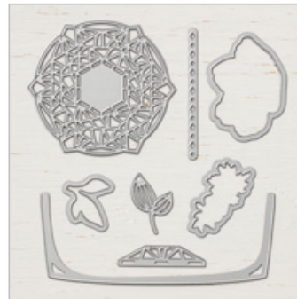
Beautiful Layers Dies