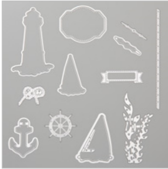
Smooth Sailing Dies