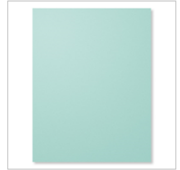
Pool Party 8-1/2" X 11" Cardstock