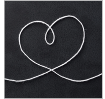
Whisper White Solid