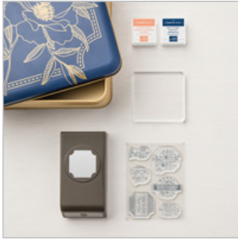
Darling Label Punch Box