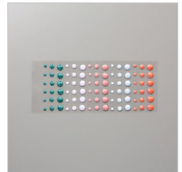
2019-2021 In Color Faceted Dots