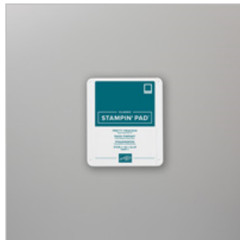
Pretty Peacock Classic Stampin' Pad