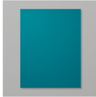
Pretty Peacock 8-1/2" X 11" Cardstock