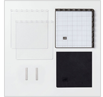
Everything Is Rosy Product Medley