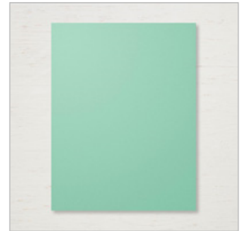
Coastal Cabana 8-1/2" X 11" Cardstock