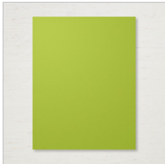
Granny Apple Green 8-1/2" X 11" Cardstock