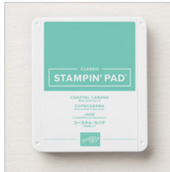
Coastal Cabana Classic Stampin' Pad