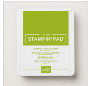
Granny Apple Green Stampin' Pad