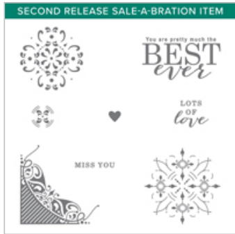
All Adorned Photopolymer Stamp