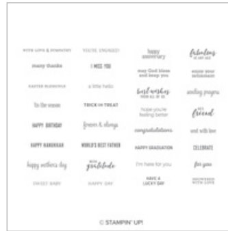
Itty Bitty Greetings Wood-Mount Stamp