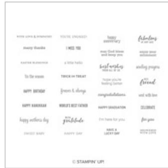
Itty Bitty Greetings Clear-Mount Stamp