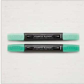
Call Me Clover Stampin' Blends Markers Combo Pack