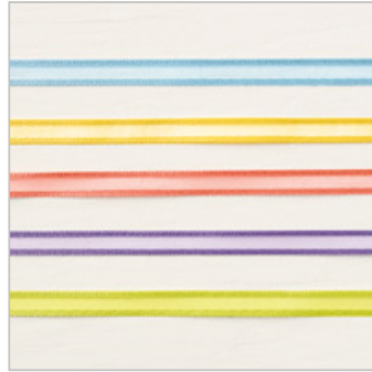
Organdy Ribbon Combo Pack