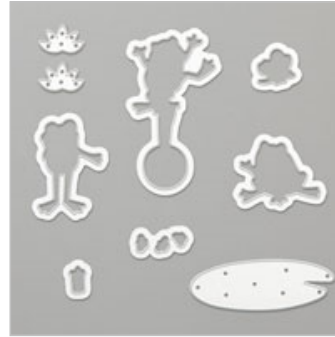
Hop Around Framelits Dies