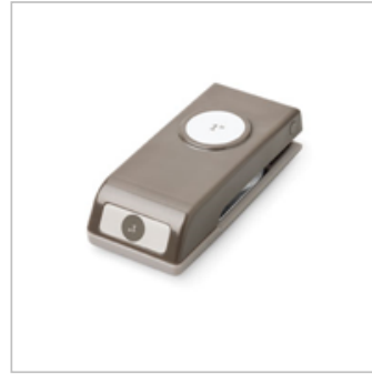
1" (2.5 Cm) Circle Punch