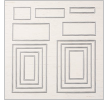
Rectangle Stitched Framelits Dies