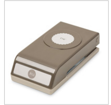
1-1/8" (2.9 Cm) Scallop Circle Punch