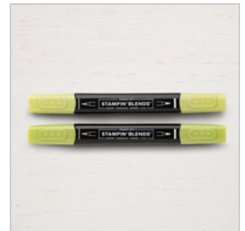
Granny Apple Green Stampin' Blends Markers Combo Pack