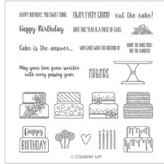
Piece Of Cake Photopolymer Stamp