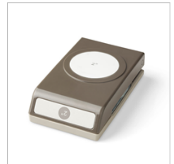
2" (5.1 Cm) Circle Punch