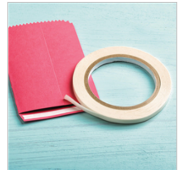
Tear & Tape