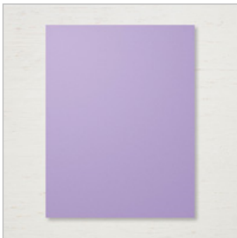
Highland Heather 8-1/2" X 11" Cardstock