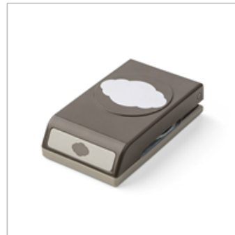
Pretty Label Punch