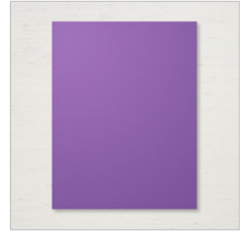
Gorgeous Grape 8-1/2" X 11" Cardstock