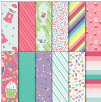
How Sweet It Is 12" X 12" (30.5 X 30.5 Cm)