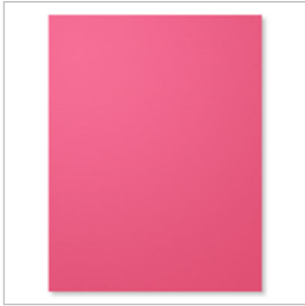
Melon Mambo 8-1/2" X 11" Cardstock