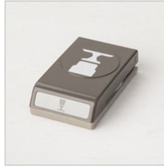
Cake Builder Punch