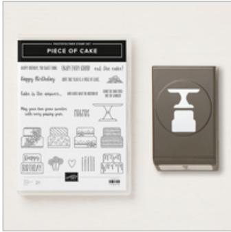
Piece Of Cake Photopolymer Bundle