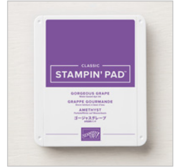
Gorgeous Grape Classic Stampin' Pad