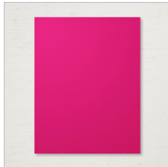
Lovely Lipstick 8-1/2 X 11" Cardstock