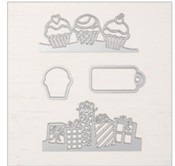
Detailed Birthday Edgelits Dies