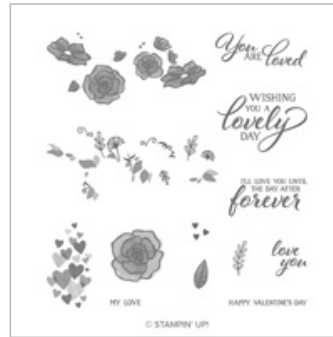
Forever Lovely Photopolymer Stamp Set