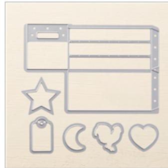
Wood Crate Framelits Dies