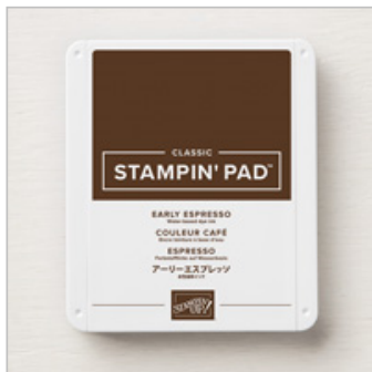
Early Espresso Classic Stampin' Pad