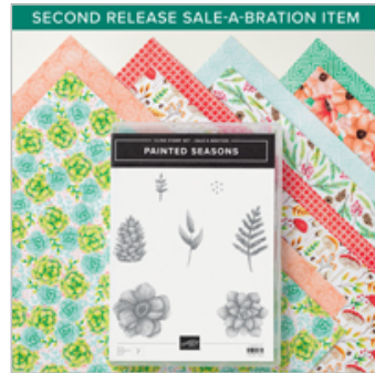
Painted Seasons Bundle