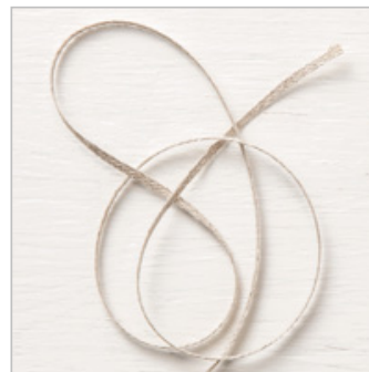
3/16" (1 Cm) Braided Linen Trim