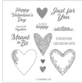
Meant To Be Cling Stamp Set