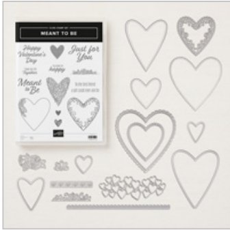
Meant To Be Cling Bundle