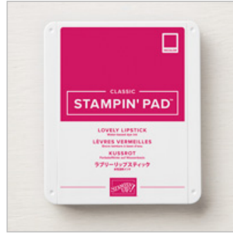
Lovely Lipstick Classic Stampin' Pad