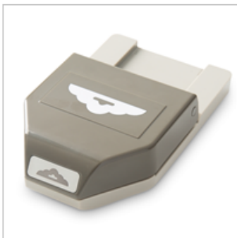
Scalloped Tag Topper Punch