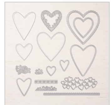
Be Mine Stitched Framelits Dies