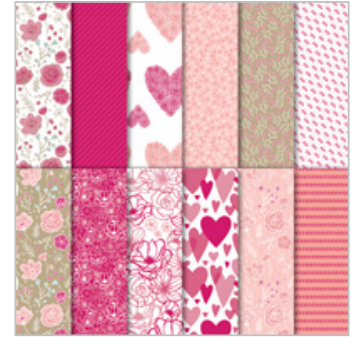
All My Love 12" X 12" (30.5 X 30.5 Cm) Designer Series Paper