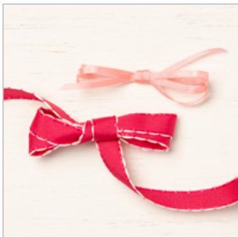
All My Love Ribbon Combo Pack