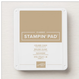
Crumb Cake Classic Stampin' Pad