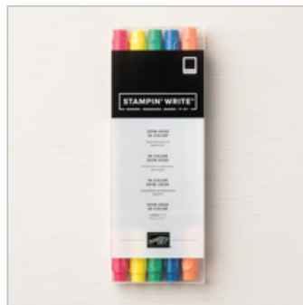
In Color 2018-2020 Stampin' Write Markers