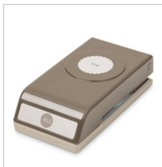
1-1/8" (2.9 Cm) Scallop Circle Punch