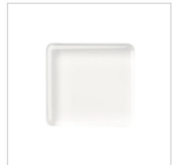
Clear Block D