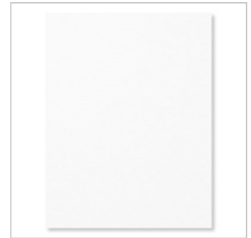
Whisper White 8-1/2\" X 11\" Cardstock