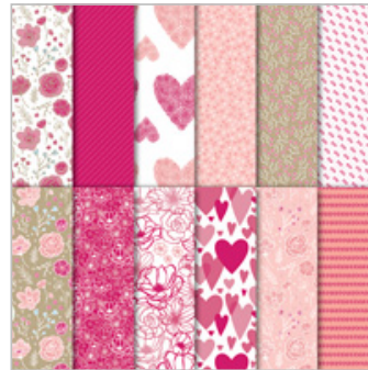
All My Love 12\" X 12\" (30.5 X 30.5 Cm) Designer Series Paper