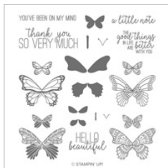
Butterfly Gala Photopolymer Stamp Set