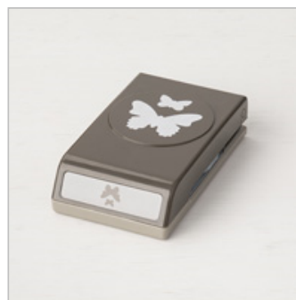
Butterfly Duet Punch