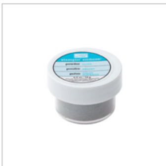
Silver Stampin' Emboss Powder