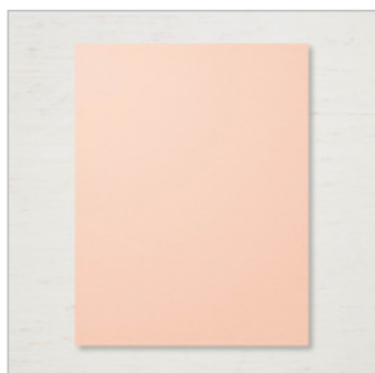
Petal Pink 8-1/2" X 11" Cardstock