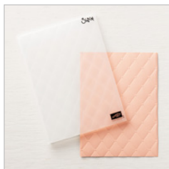
Tufted Dynamic Textured Impressions Embossing Folder