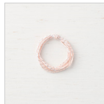
Silver & Petal Pink Baker's Twine