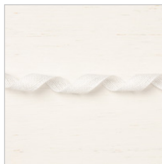
Whisper White 5/8" (1.6 Cm) Flax Ribbon