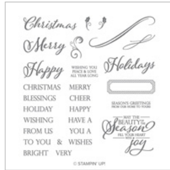
Merry Christmas To All Photopolymer Stamp Set