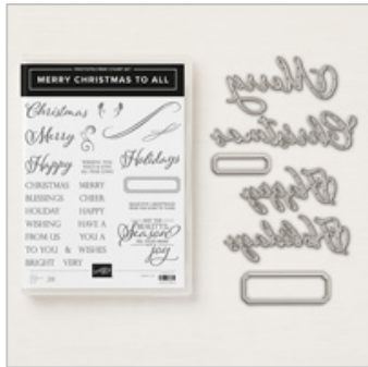
Merry Christmas To All Photopolymer Bundle