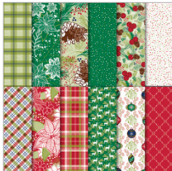
Under The Mistletoe Designer Series Paper