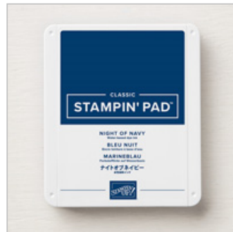
Night Of Navy Classic