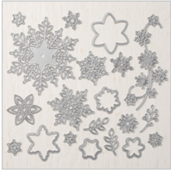
Snowfall Thinlits Dies