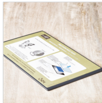
Precision Base Plate