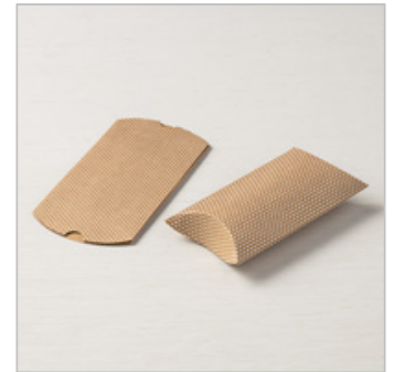
Kraft Pillow Boxes