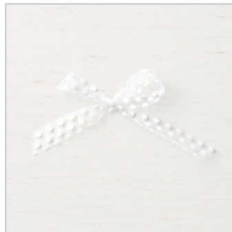
Whisper White 5/8\" (1.6 Cm) Polka Dot