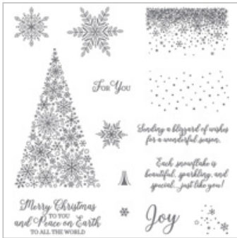
Snow Is Glistening Photopolymer Stamp