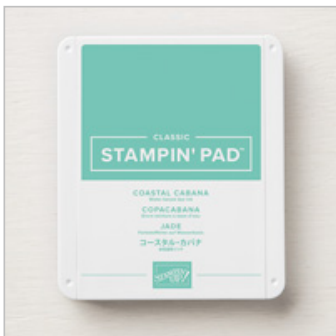
Coastal Cabana Classic Stampin' Pad