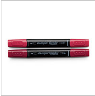
Cherry Cobbler Stampin' Blends Markers Combo Pack