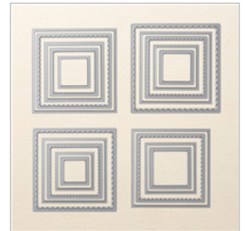
Layering Squares Framelits Dies