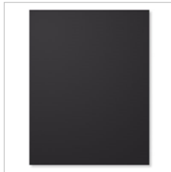
Basic Black 8-1/2" X 11" Cardstock