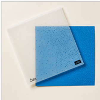
Softly Falling Textured Impressions Embossing Folder