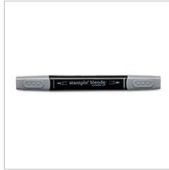
Smoky Slate Dark Stampin' Blends Marker