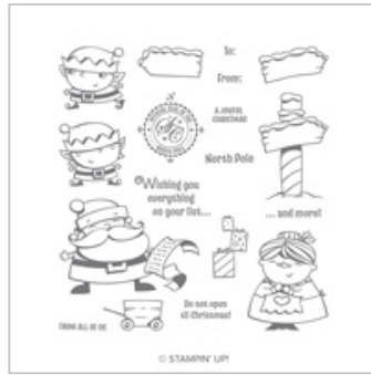
Signs Of Santa Photopolymer Stamp Set