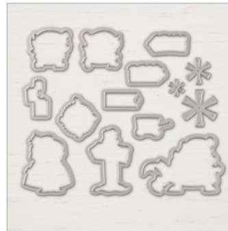
Santa's Signpost Framelits Dies