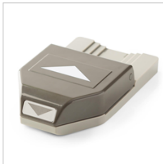
Banner Triple Punch