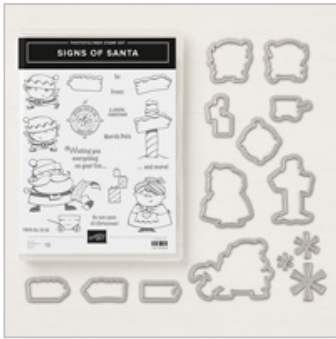
Signs Of Santa Photopolymer Bundle