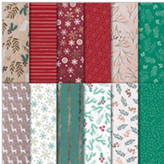
Joyous Noel 12" X 12" (30.5 X 30.5 Cm) Specialty Designer Series Paper