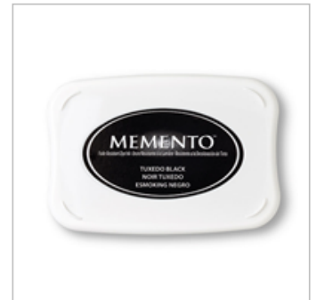
Tuxedo Black Memento Ink Pad