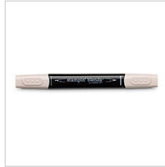
Ivory Stampin' Blends Marker