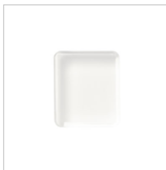
Clear Block C