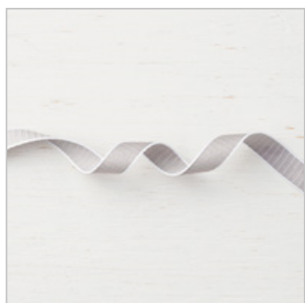
Gray Granite 1/2" (1.3 Cm) Textured Weave