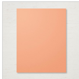
Grapefruit Grove 8- 1/2" X 11" Cardstock