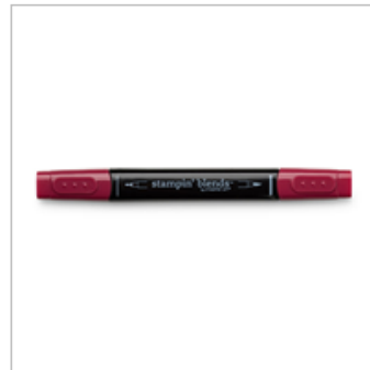
Cherry Cobbler Dark Stampin' Blends Marker