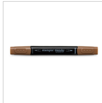
Bronze Stampin' Blends Marker