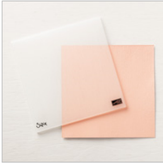
Subtle Dynamic Textured Impressions Embossing Folder