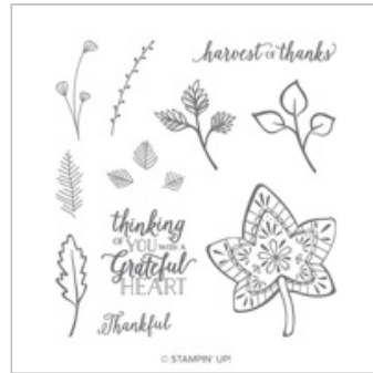
Falling For Leaves Photopolymer Stamp Set