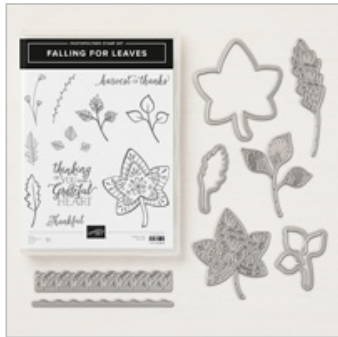
Falling For Leaves Photopolymer Bundle