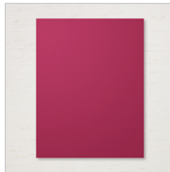
Merry Merlot 8-1/2" X 11" Cardstock