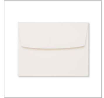
Very Vanilla Medium Envelopes