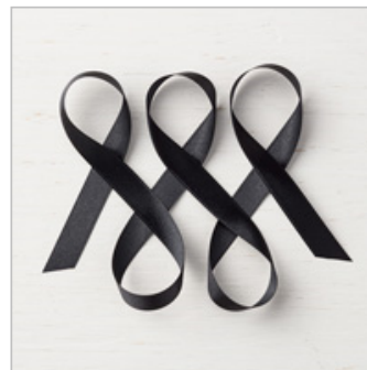
Black 1/2" (1.3 Cm) Satin Ribbon