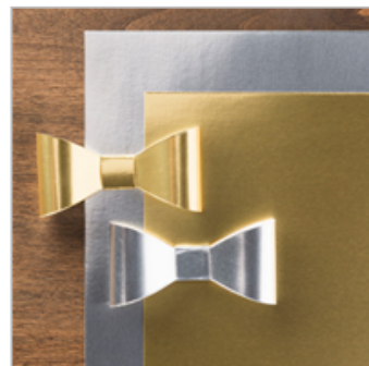
Gold Foil Sheets