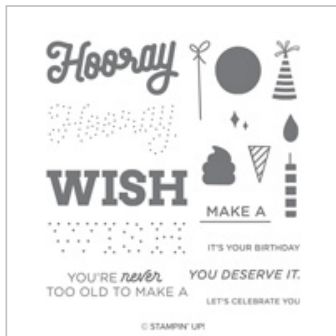
Broadway Birthday Photopolymer Stamp Set