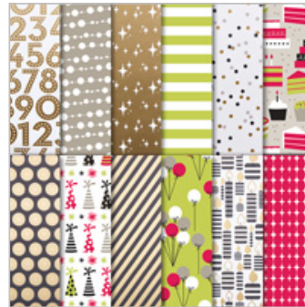
Broadway Bound Speciality Designer Series Paper