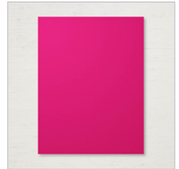
Lovely Lipstick 8-1/2" X 11" Cardstock