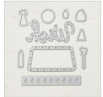
Broadway Lights Framelits Dies