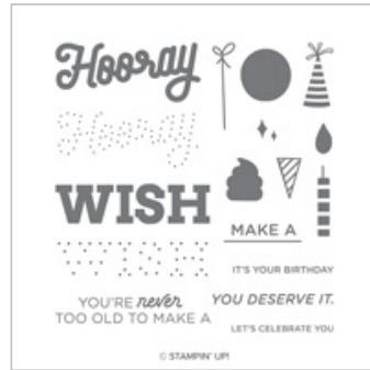
Broadway Birthday Photopolymer Stamp Set