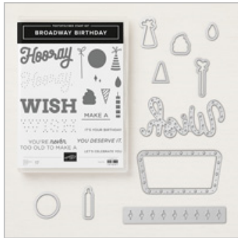
Broadway Birthday Photopolymer Bundle