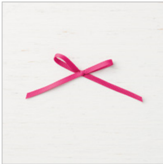
Lovely Lipstick 1/8" (3.2 Mm) Grosgrain Ribbon