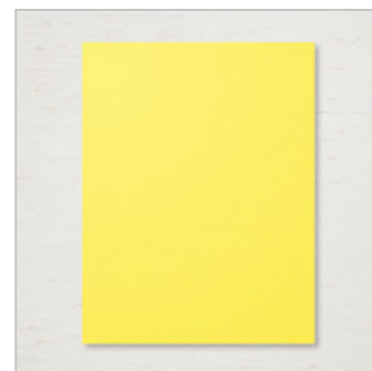
Pineapple Punch 8-1/2" X 11" Cardstock