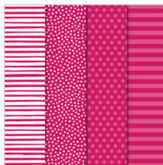
In Color 2018-2020 6" X 6" (15.2 X 15.2 Cm) Designer Series Paper