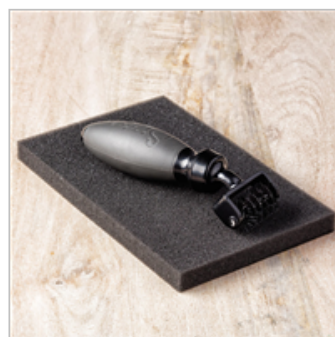
Big Shot Die Brush -