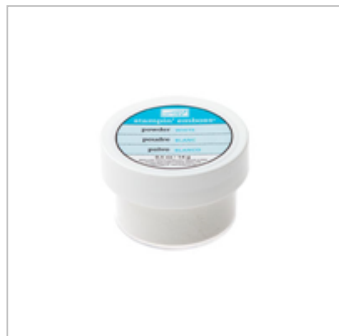
White Stampin' Emboss Powder