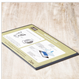
Precision Base Plate