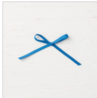
Blueberry Bushel 1/8" (3.2 Mm) Grosgrain Ribbon