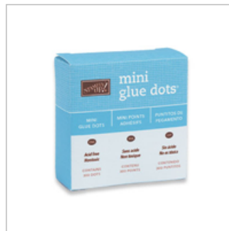
Mini Glue Dots