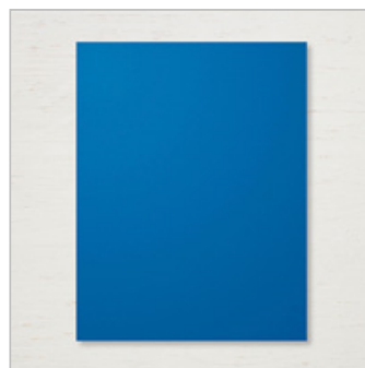
Blueberry Bushel 8-1/2" X 11" Cardstock