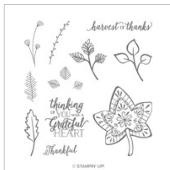
Falling For Leaves Photopolymer Stamp Set