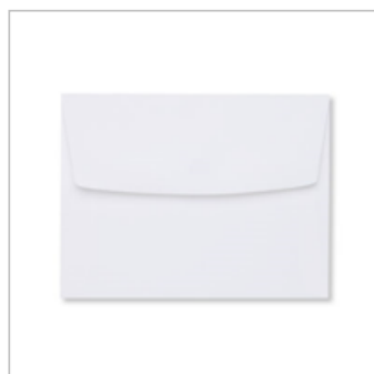
Whisper White Medium Envelopes