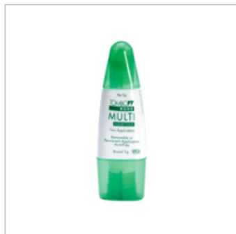
Multipurpose Liquid Glue