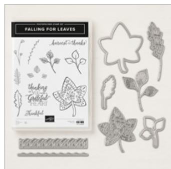
Falling For Leaves Photopolymer Bundle