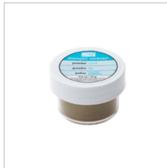
Gold Stampin' Emboss Powder