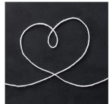
Whisper White Solid Baker's Twine