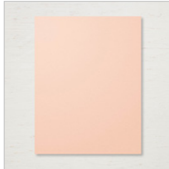
Petal Pink 8-1/2" X 11" Cardstock