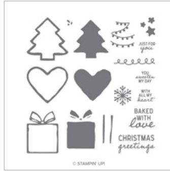
Nothing Sweeter Photopolymer Stamp