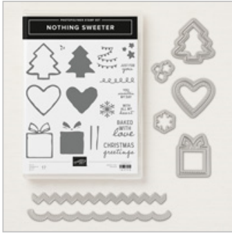
Nothing Sweeter Photopolymer Bundle