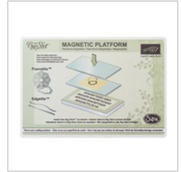
Magnetic Platform" data-bbox="735 304 927 326"/>