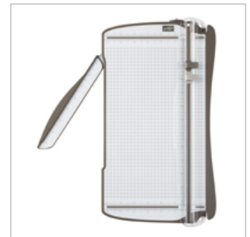
Stampin' Trimmer" data-bbox="735 619 925 641"/>