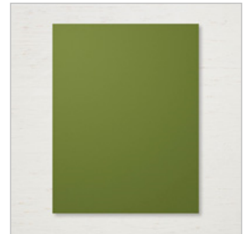
Mossy Meadow 8-1/2" X 11" Cardstock