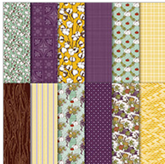
Country Lane 12" X 12" (30.5 X 30.5 Cm)