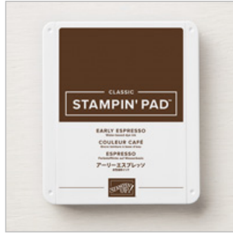
Early Espresso Classic Stampin' Pad" data-bbox="283 304 491 350"/>