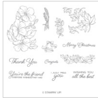
Blended Seasons Wood-Mount Stamp Set