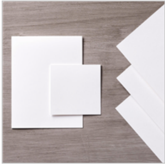
Whisper White 8-1/2\" data-bbox="60 304 278 350"/>