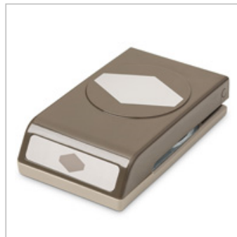
Tailored Tag Punch" data-bbox="290 619 484 641"/>