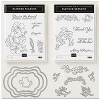
Blended Seasons Wood-Mount Bundle