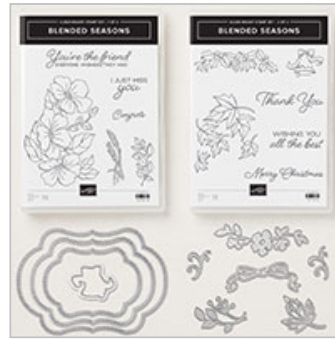
Blended Seasons Clear-Mount Bundle