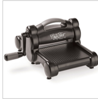
Big Shot" data-bbox="562 304 652 326"/>