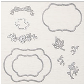
Stitched Seasons Framelits Dies" data-bbox="82 619 254 665"/>