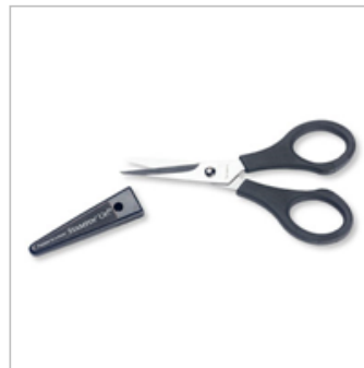
Paper Snips" data-bbox="545 619 669 641"/>