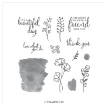
Love What You Do Photopolymer Stamp Set