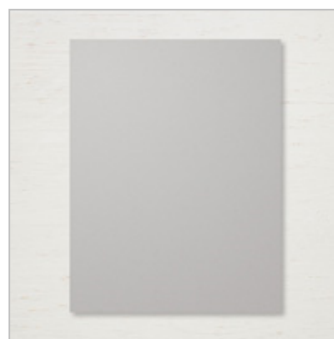
Gray Granite 8-1/2" X 11" Cardstock