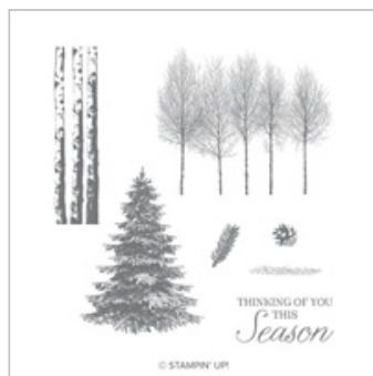
Winter Woods Wood-Mount Stamp Set