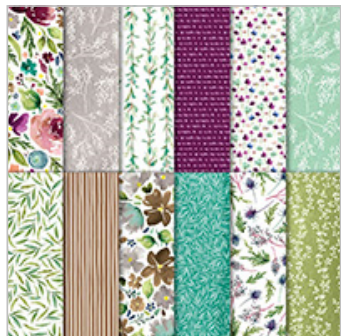
Frosted Floral 12" X 12" (30.5 X 30.5 Cm) Specialty Designer Series Paper