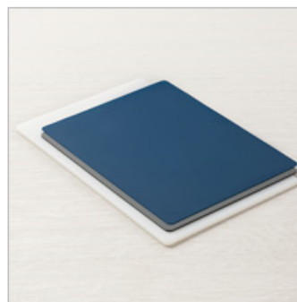
Big Shot Embossing Mats