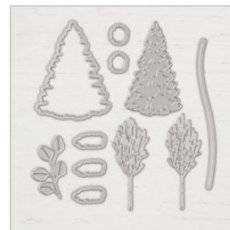
In The Woods Framelits Dies