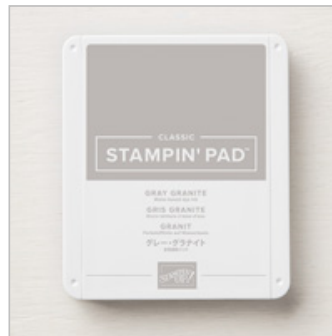
Gray Granite Classic Stampin' Pad