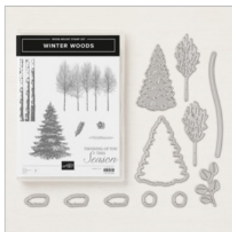
Winter Woods Wood-Mount Bundle