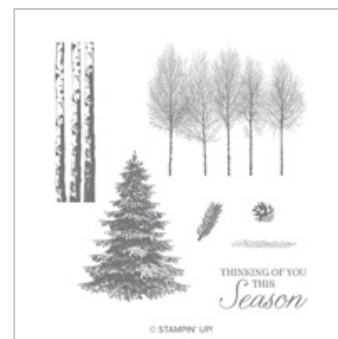
Winter Woods Clear-Mount Stamp Set