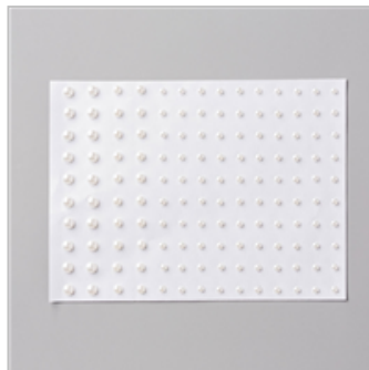
Pearl Basic Jewels