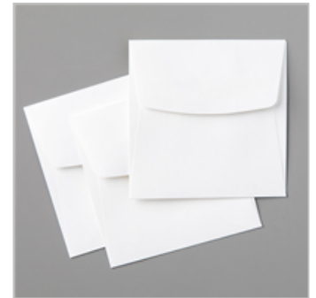
Whisper White 3" X 3" (7.6 X 7.6 Cm) Envelopes