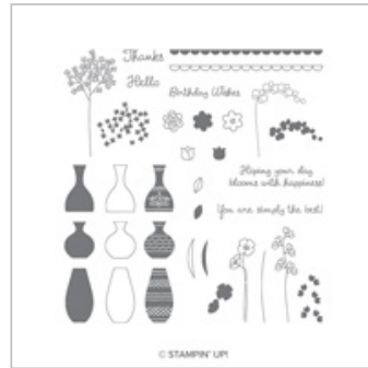
Varied Vases Photopolymer Stamp Set