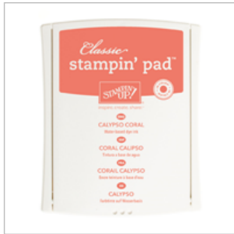
Calypso Coral Classic Stampin' Pad