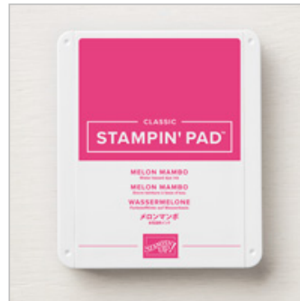
Melon Mambo Classic Stampin' Pad