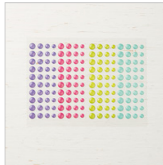
Glitter Enamel Dots