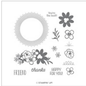
Bouquet Blooms Photopolymer Stamp