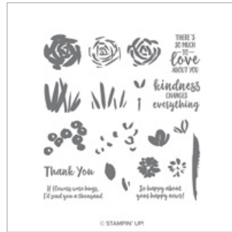
Abstract Impressions Photopolymer Stamp