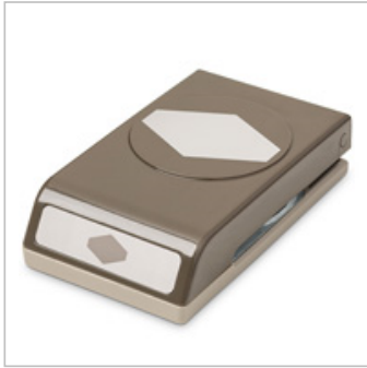
Tailored Tag Punch