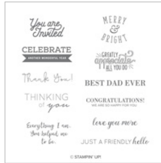
Another Wonderful Year Clear-Mount Stamp Set