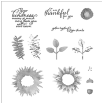
Painted Harvest Photopolymer Stamp Set