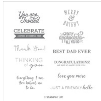
Another Wonderful Year Wood-Mount Stamp Set