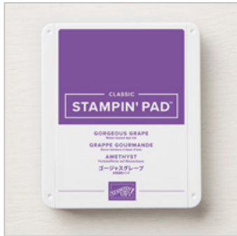
Gorgeous Grape Classic Stampin' Pad