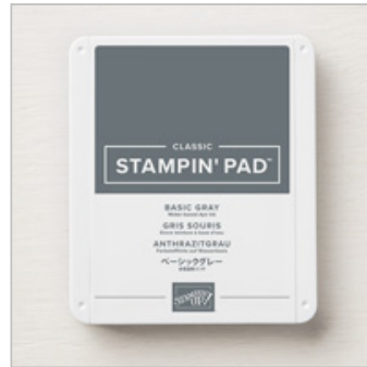
Basic Gray Classic Stampin' Pad