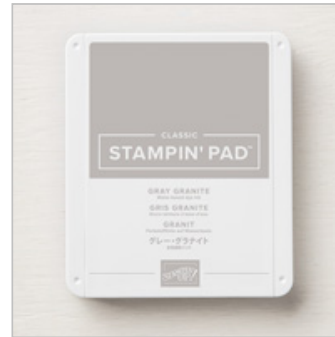
Gray Granite Classic Stampin' Pad