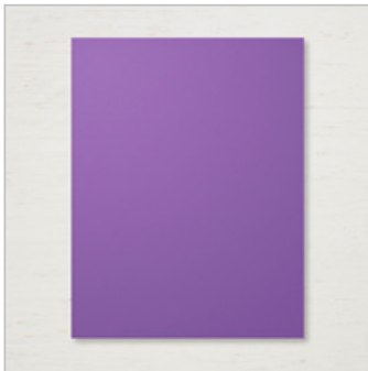
Gorgeous Grape 8-1/2" X 11" Cardstock