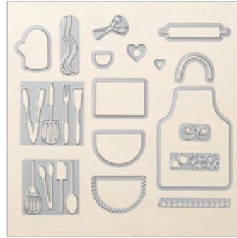
Apron Builder Framelits Dies