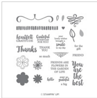
A Big Thank You Photopolymer Stamp