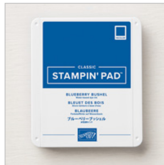
Blueberry Bushel Classic Stampin' Pad