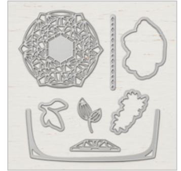
Beautiful Layers Thinlits Dies