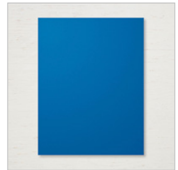
Blueberry Bushel 8- 1/2" X 11" Cardstock