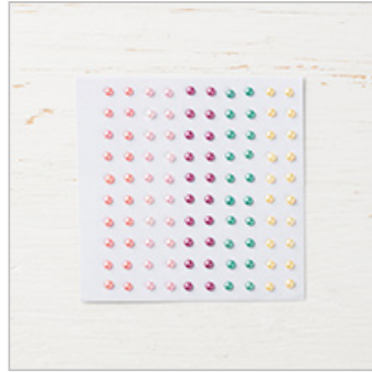
Share What You Love