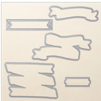
Bunch Of Banners