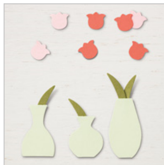
Vases Builder Punch