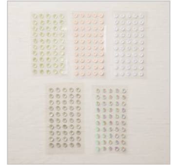
Basic Adhesive- Backed Sequins