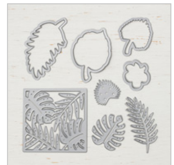
Tropical Thinlits Dies