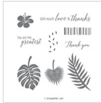
Tropical Chic Wood-Mount Stamp Set