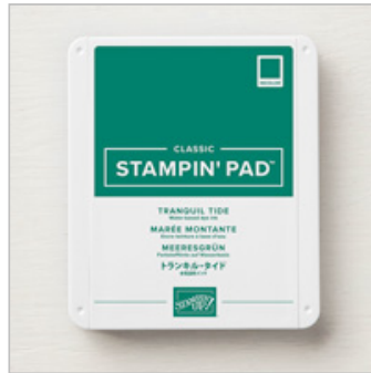
Tranquil Tide Classic Stampin' Pad