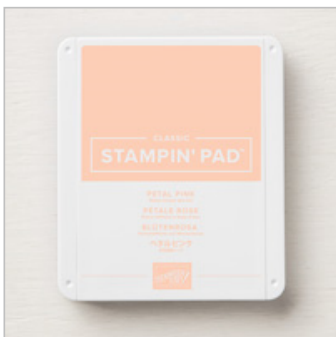
Petal Pink Classic Stampin' Pad