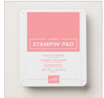
Flirty Flamingo Classic Stampin' Pad