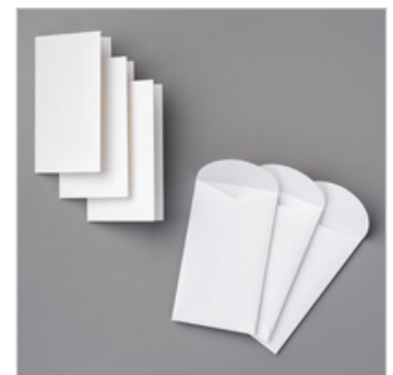
Whisper White Narrow Note Cards & Envelopes