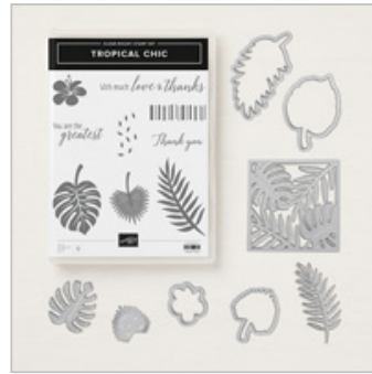
Tropical Chic Clear-Mount Bundle