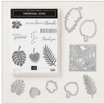
Tropical Chic Wood-Mount Bundle