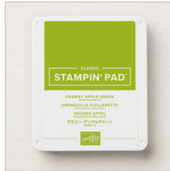
Granny Apple Green Classic Stampin' Pad