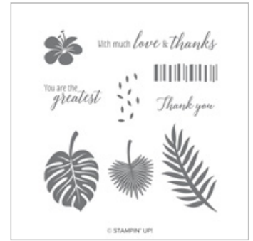
Tropical Chic Clear-Mount Stamp Set