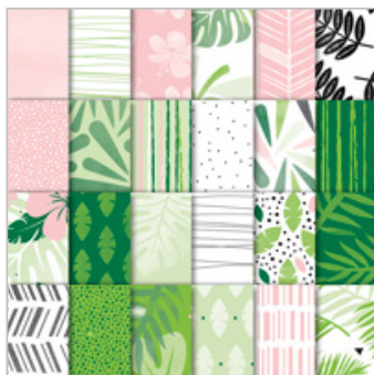
Tropical Escape 6" X 6" (15.2 X 15.2 Cm)