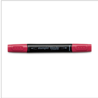
Cherry Cobbler Light Stampin' Blends Marker