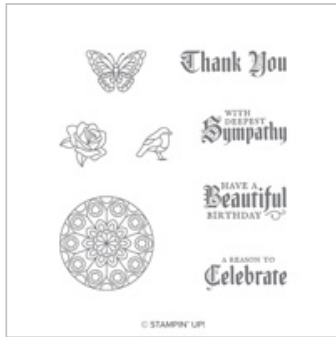
Painted Glass Wood-Mount Stamp Set