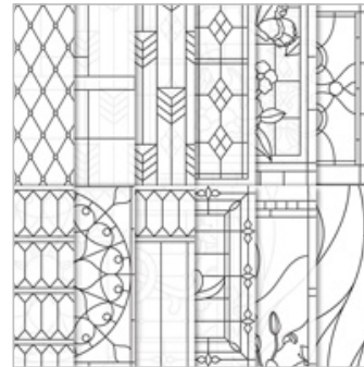
Graceful Glass 6" X 6" (15.2 X 15.X Cm)