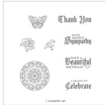
Painted Glass Clear-Mount Stamp Set