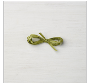
Old Olive 1/8" Sheer Ribbon