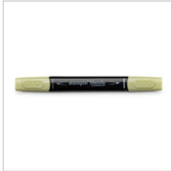
Old Olive Light Stampin' Blends Marker