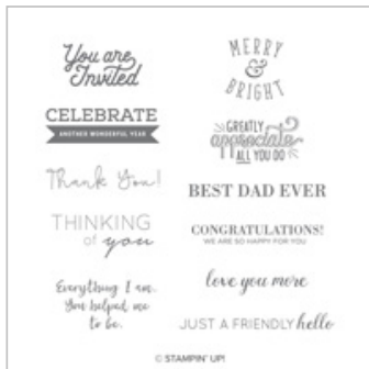
Another Wonderful Year Wood-Mount Stamp Set