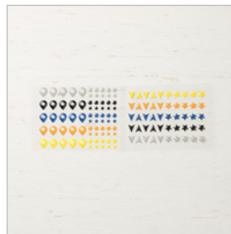
Best Route Enamel Shapes