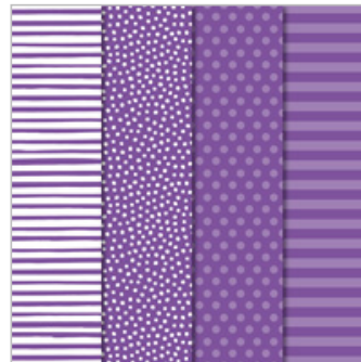
Brights 6" X 6" (15.2 X 15.2 Cm) Designer Series Paper