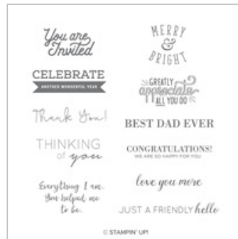
Another Wonderful Year Clear-Mount Stamp Set