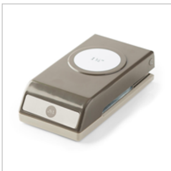
1-1/2" (3.8 Cm) Circle Punch