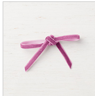
Rich Razzleberry 1/4" (6.4 Mm) Velvet Ribbon