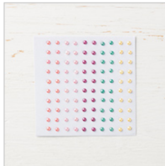
Share What You Love Artisan Pearls