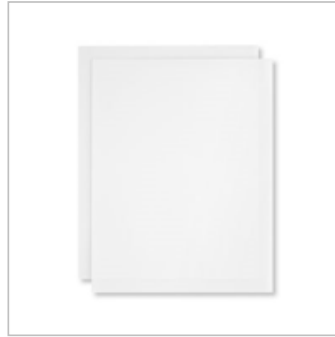
Vellum 8-1/2" X 11" Cardstock