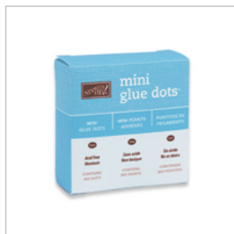
Mini Glue Dots