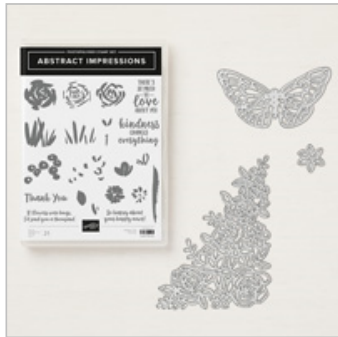
Abstract Impressions Photopolymer Bundle