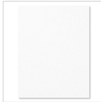
Whisper White 8-1/2" X 11" Cardstock