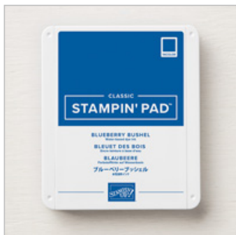
Blueberry Bushel Classic Stampin' Pad