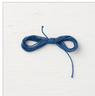
Night Of Navy Medium Baker's Twine