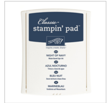
Night Of Navy Classic Stampin' Pad