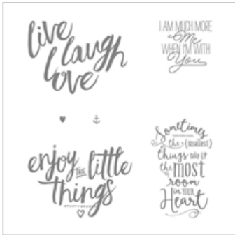
Layering Love Wood-Mount Stamp Set