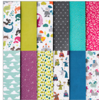
Myths & Magic Specialty Designer Series Paper