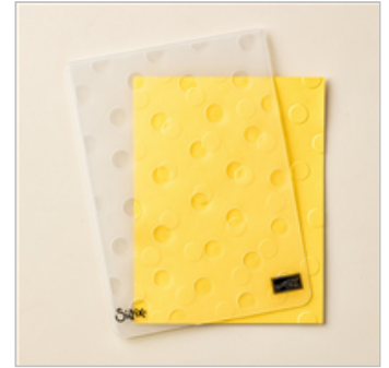
Polka Dot Basics Textured Impressions Embossing Folder