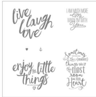
Layering Love Clear-Mount Stamp Set