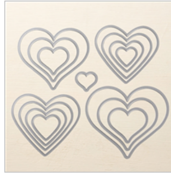
Sweet & Sassy Framelits Dies