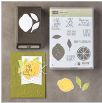
Lemon Zest Wood-Mount Bundle