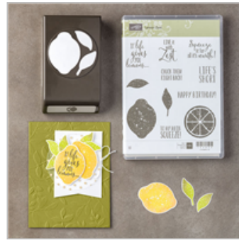
Lemon Zest Clear-Mount Bundle