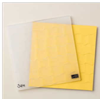
Ruffled Dynamic Textured Impressions Embossing Folder