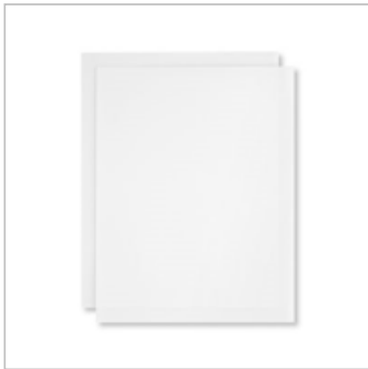
Vellum 8-1/2" X 11"