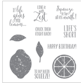
Lemon Zest Wood-Mount Stamp Set