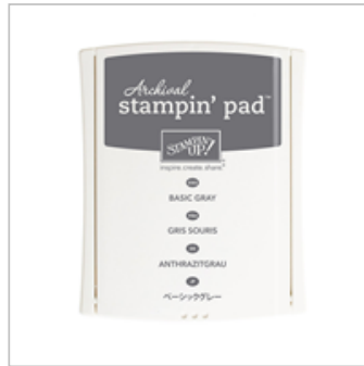
Basic Gray Archival