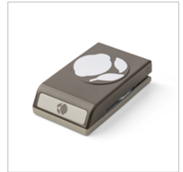
Lemon Builder Punch