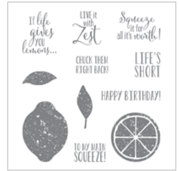
Lemon Zest Clear-Mount Stamp Set