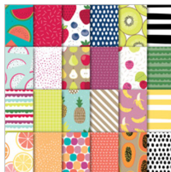
Tutti-Frutti 6" X 6" (15.2 X 15.2 Cm) Designer Series Paper