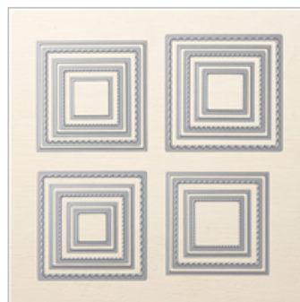
Layering Squares Framelits Dies