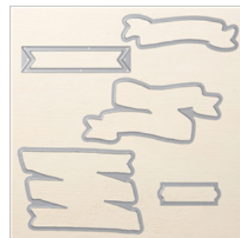
Bunch Of Banners Framelits Dies