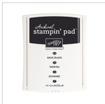
Basic Black Archival Stampin' Pad