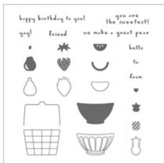
Fruit Basket Photopolymer Stamp Set