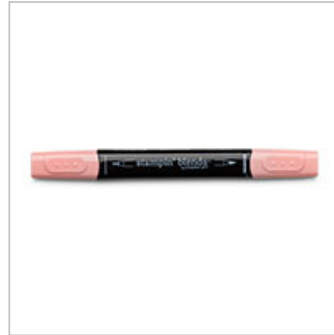
Calypso Coral Light Stampin' Blends Marker