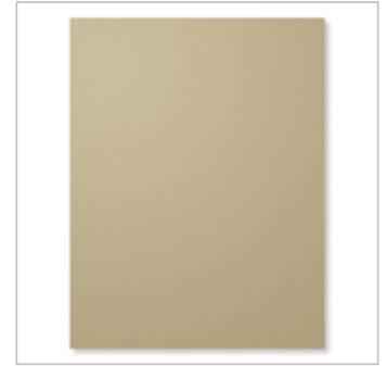
Crumb Cake 8-1/2" X 11" Cardstock