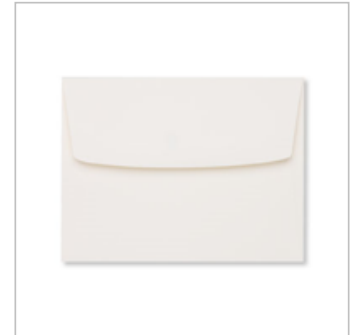
Very Vanilla Medium Envelopes