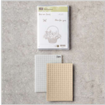
Blossoming Basket Wood-Mount Bundle