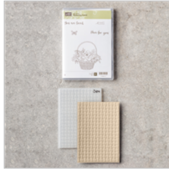
Blossoming Basket Clear-Mount Bundle