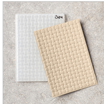
Basket Weave Dynamic Textured Impressions Embossing Folder