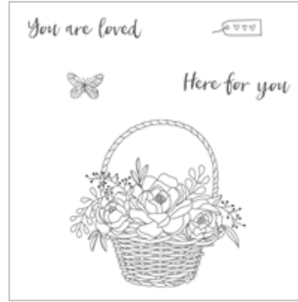
Blossoming Basket Clear-Mount Stamp