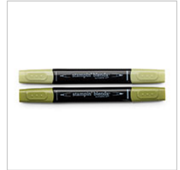
Old Olive Stampin' Blends Markers Combo Pack