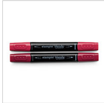
Cherry Cobbler Stampin' Blends Markers Combo Pack